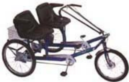
Team Dual Trike shown with optional and Swivel Down Armrests

Here are answers to some of the most frequently asked questions about the Worksman Team Dual Tricycle: