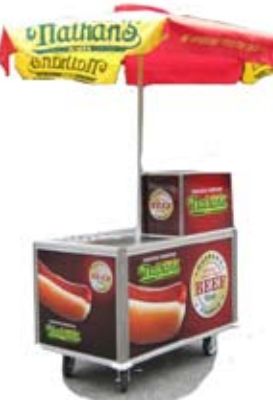
is the leading manufacturer of specialty vehicles for corporate branding, promotion and sampling...