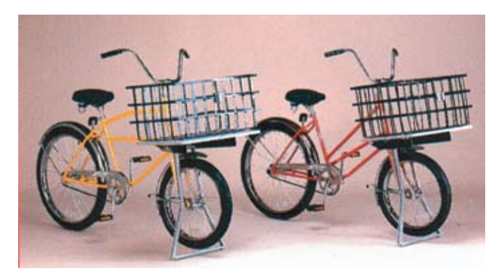
MODEL LGB (Men's) MODEL LGG (Unisex) Includes exclusive "Tri-Swivel" parking stand, 24"x17"x12" flat steel basket and unique "Balance-Tru" steering system

From shipyards to movie lots, newspaper delivery to the U.S. Postal Service, country club to country store, The Industrial Bikes keep delivering. Credit the fully-lugged frame, knock-out front hubs, "posi-quad" welding, and steel clincher rims. These and hundreds of other "WORKSMAN TOUGH" features are what make the "Industrials" the bike of choice among leading companies the world over. And to prove that extraordinary toughness need not mean ordinary looks, the Industrials carry the classic American profile, set off beautifully by the standard or optional paint choices.