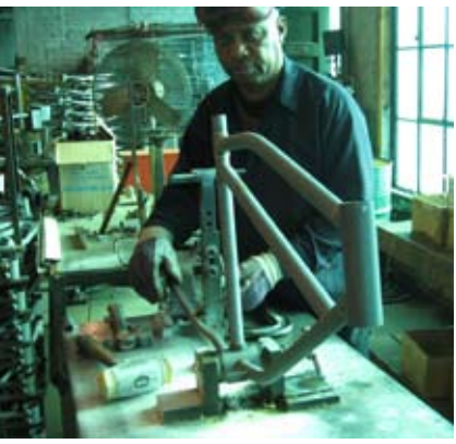
Every Worksman Industrial Cycle is hand-assembled.