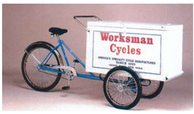
MODEL SUD: SUPER DELIVERY TRICYCLE 42"x26"x25" steel non-insulated storage cabinet