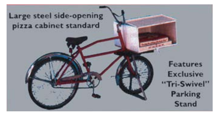
MODEL LGP-S "Slice and A Coke" Pizza Bike