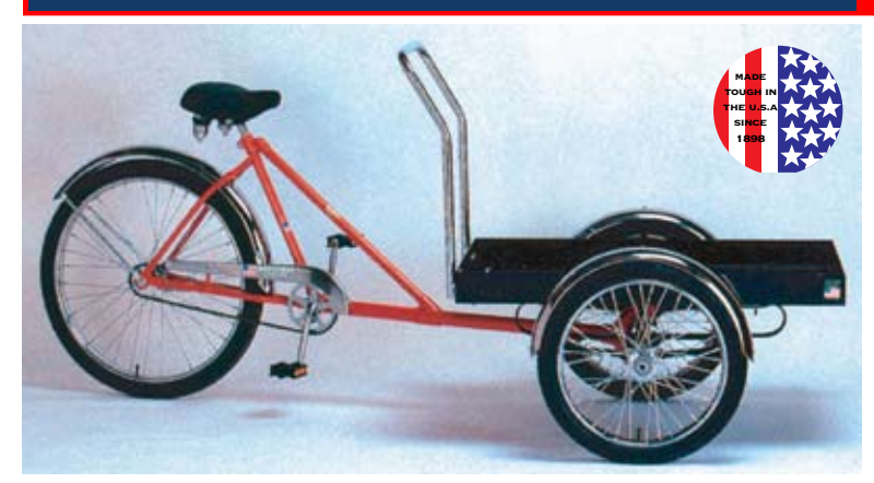
MODEL STPT: STANDARD PLATFORM TRIKE 38"x26"x3"(lip height) steel platform