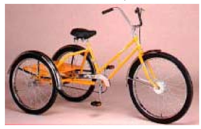
ADC SERIES: ADAPTABLE TRIKE WITH PLATFORM

ADC-CB: Front Drum Brake & Rear Coaster Brake ADC-3CB: Front Drum Brake & 3-Speed Coaster Brake