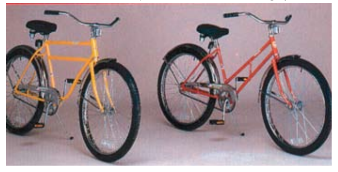
MODEL 2600: Large Frame Industrial Bicycle MODEL ING: Industrial NewsGirl