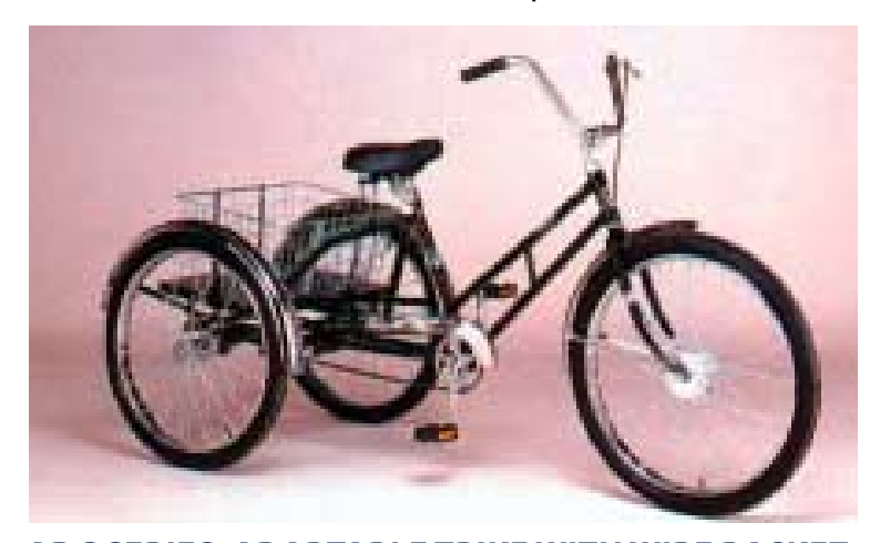
ADC SERIES: ADAPTABLE TRIKE WITH WIRE BASKET

ADP-CB: Front Drum Brake & Rear Coaster Brake ADP-3CB: Front Drum Brake & 3-Speed Coaster Brake