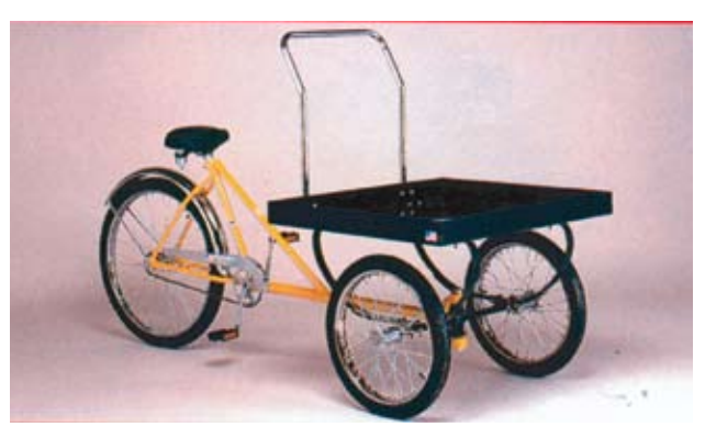
MODEL U: UTILITY TRICYCLE 34"x30"x3"(lip height) steel platform