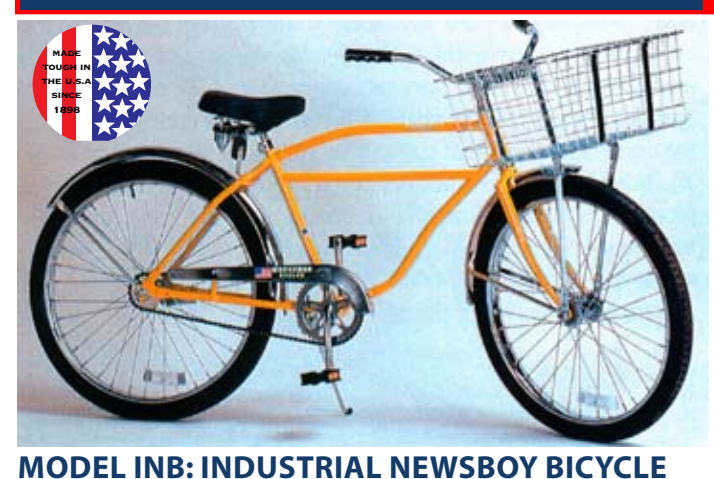
INB in Safety Yellow shown with optional G2 front basket)

The Classic American Bike - but with a big difference. These are built "WORKSMAN TOUGH" for day-in, day-out use. Thousands of these rugged performers report to work each morning - but never get to rest at night!