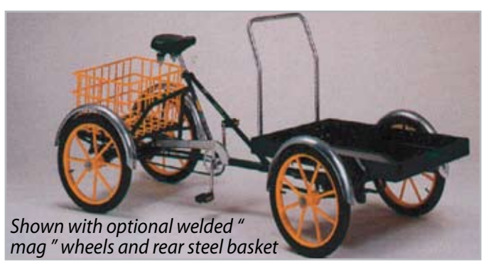
MODEL WTC 4X4: INDUSTRIAL QUADRACYCLE 38"x26"x3"(lip height) steel front platform and 22"x15" rear steel platform

The Front Loaders set the standard for heavy-duty cycle applications with an amazing one-quarter ton total load capacity! Just how the Front Loaders are able to stand-up to such demanding loads, while remaining maneuverable and safe, is a testimonial to Worksman design. The 14 gauge main bar, coupled with a 1" diameter solid steel axle and ball-bearing hubs, handles loads that would crush an ordinary cycle. Double leaf spring platform suspension and massive machined steering spindle with malleable head lug beg for the toughest loads. For extra safety, all Front Loaders are equipped with a "super-duty" rear coaster brake 11 gauge spoke wheels. For even greater strength, The Front Loaders, like all Worksman Tricycles, are available with welded steel "mag" wheels fitted with puncture-resistant or airless technology tires.